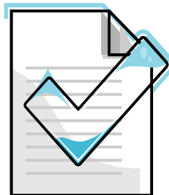
ShelterCare Gift Offer Sent to Client – Client must call to activate within 5 days of adoption

Note: Animals between 8-12 weeks of age do not require a microchip to receive the Gift of Insurance by Email.