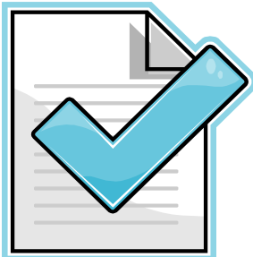
Gift of Insurance Issued by Email

Note: Animals between 8-12 weeks of age do not require a microchip to receive the Gift of Insurance by Email.