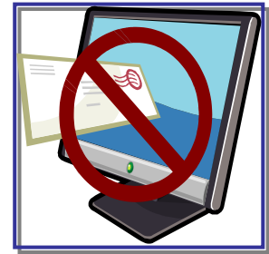
No Email Address